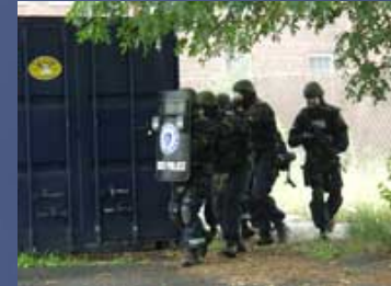
MSP STOP Team