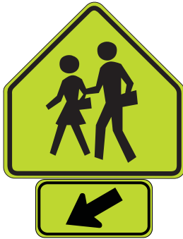
School Crosswalk Warning Assembly (MUTCD S1-1) (MUTCD W16-7p)