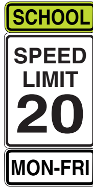
School Speed Limit Assembly (MUTCD S4-3) (MUTCD R2-1) (MUTCD S4-6)