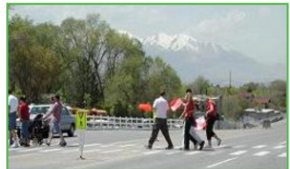
Pedestrians cross the street using flags to increase visibility.

Six initial crosswalks were outfitted with flags in August of 2000. By 2007 there were 40 city-maintained downtown flag locations. Due to the lack of available funds and an increased demand of crosswalks with flags, the city began an Adopt-a-Crosswalk program in January 2001. The Adopt-a-Crosswalk program allows individuals or businesses within a one block radius of a marked crosswalk to “adopt” the crosswalk. This program requires that the sponsor monitors the flags and purchases replacement flags when needed. The city installs the flag holders and usage signs, and provides the initial supply of flags at no cost; replacement flags are available for $0.50 each.