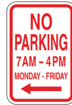
School No Parking