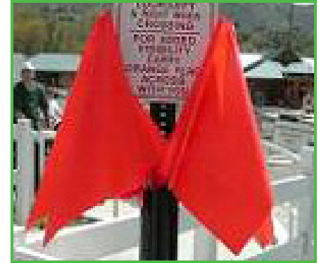
Flags used in the program.

The Mayor of Salt Lake City in 2000, Rocky Anderson, responded to a national study that declared Salt Lake City as “not pedestrian friendly” by creating a Pedestrian Safety Committee aimed at reducing pedestrian injury accidents. The committee implemented several different safety measures, including crosswalk flags and the Adopt-a-Crosswalk Program.