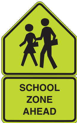
School Speed Limit Advance Warning (MUTCD S4-5)