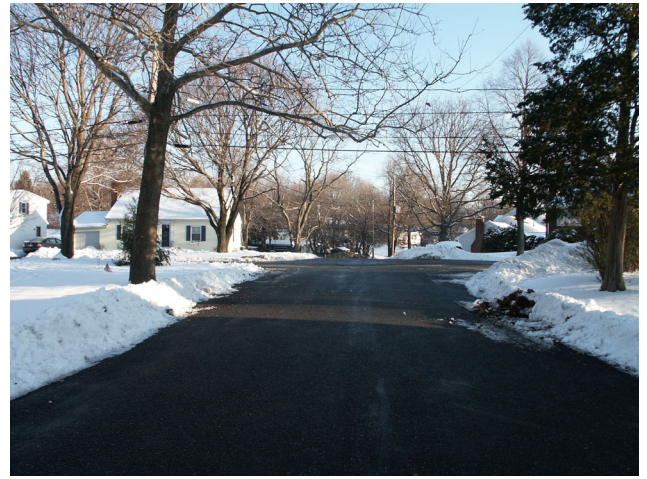
Approaching from Wheeler Lane. South to North view.